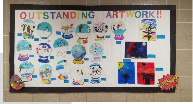
Artwork on display at Westwood Elementary School